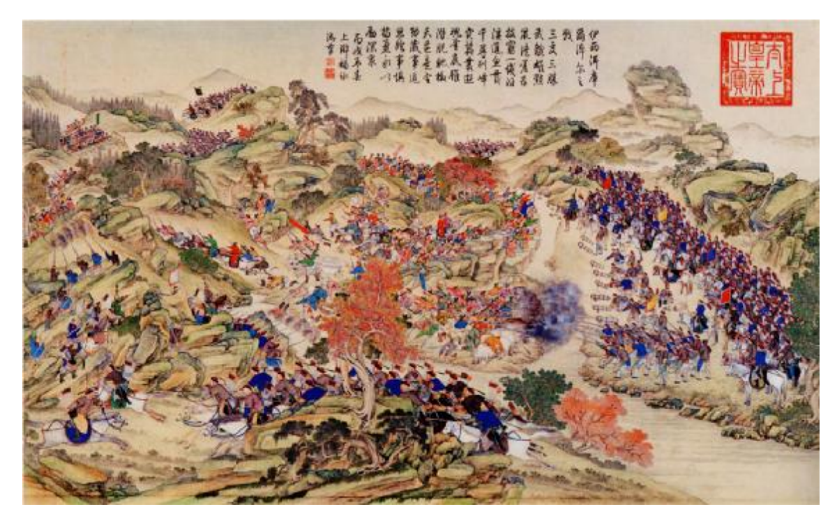
The Chinese army defeats the Khoja brothers Burhān al-Dīn and Khwāja-i Jahān in Yesil-Kol-Nor 1759 (Source: <a href="http://en.wikipedia.org/wiki/Battle_of_Yesil_Kol_Nor">http://en.wikipedia.org/wiki/Battle_of_Yesil_Kol_Nor</a> and <a href="http://www.battle-of-qurman.com.cn/e/hist.htm">http://www.battle-of-qurman.com.cn/e/hist.htm</a>)

after the outrage by Ahmed Shah Durani of Kabul, when the treacherous Sultan Shah was put to death; in the beginning of this [19th] century by Kokan Beg of Kunduz; and again in 1829 by his successor Murad Beg, who swept away the bulk of the remaining inhabitants, and set them down to die in the marshy plains of Kunduz."